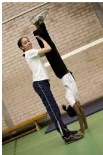
Below: PE lesson