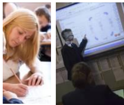
Above: Students teaching a class plenary

Support and extra provision is also available for the most able students. Our gifted and talented students can attend extra morning sessions to extend their learning and often participate in national competitions. Some of our students have taken part in regional competitions and we currently have a very talented writer who won the Young Writers National Award.