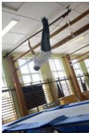
Left: Trampoline lesson

The smaller gymnasium is mainly used for gymnastics, sports acrobatics, trampolining, dance and health related fitness. Facilities provided by these buildings include girls' and boys' changing rooms and showers. Many of the sports mentioned are played on a class, house and inter-school league basis.