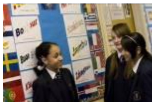
Above Left: Modern Languages

Students and staff at Bristnall Hall have supported many charities and helped to raise money through a variety of activities. These include selling ribbons for Breast Cancer, non-school dress days, the London Marathon, Run for Life and MacMillan coffee morning cake sales.