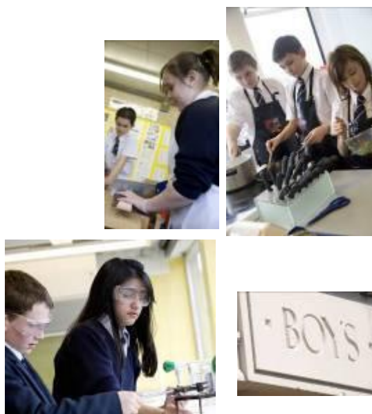
Above: Uniform and protective clothing around college