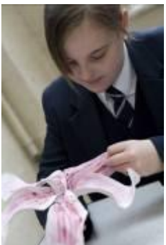
Top: Drama lesson