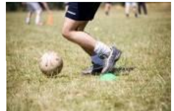
Right: Physical Education lessons