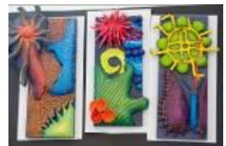
Below and right: GCSE Art work and lesson

We have two large purpose built Art rooms at Bristnall Hall. In addition there is an area used for 3-dimensional work and sculpture on a larger scale.