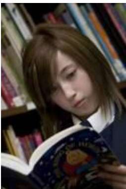
Left: Library facilities

We aim to help raise achievement by providing good quality information relevant to the needs of students and fiction that encourages students to develop as readers regardless of age or ability.