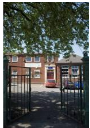
Top: Design and Technology block