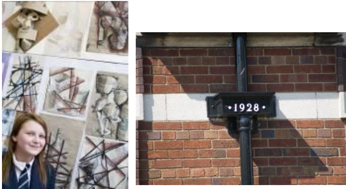
Above: Corridor displays and surrounding buildings

Bristnall Hall has a mixture of traditional and more modern buildings, all contained on one site. This is a great advantage, since students never have to waste time on long journeys between different sites. The older building contains two Halls for student gatherings, assemblies and dining. The larger hall has a stage, which is used for drama and musical productions. Both halls are used at lunch time for students to eat their lunch. Many classrooms in this part of the school have been adapted to provide specialist facilities for the major subjects and only a few remain as general-purpose classrooms.