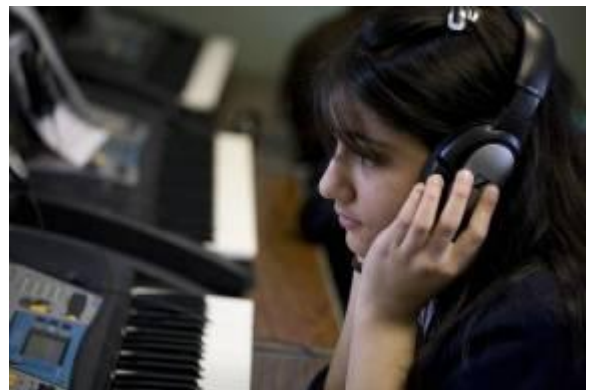
Below: Music lesson

Instrumental lessons are given by specialist peripatetic staff on a wide variety of instruments provided by the college. When students have reached a good standard, they may join one of the many college instrumental groups to work towards our regular concert programmes and may be entered for Associated Board Examinations.